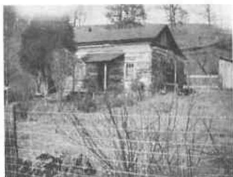
Pioneer cabin located on the east bank of the Clear Fork and below the west side of the Jedediah Smith homestead.