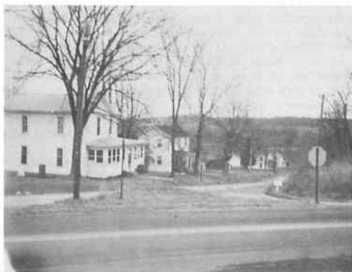
Tylertown in 1972