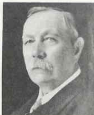
Arthur Conan Doyle, Los Angeles, 1923